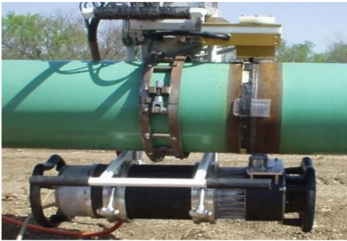
External RTR system inspecting a weld on a pipeline