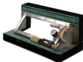
Vacuum Box Testing of floor seams & internal corners along at annular plate