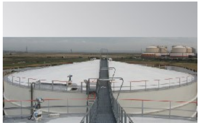
Tank Roof & Wall UT Scanners