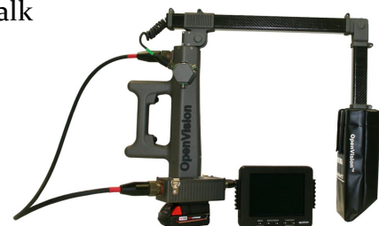
X-Ray Profiling - C-Arm Scanner for Corrosion Under Insula-