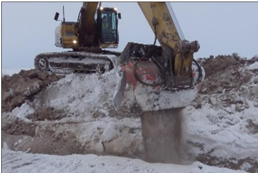
Shaker Equipment Backfilling Trench

A decision-making chain is necessary for determining if work on the construction right-of-way should occur in frozen weather conditions due to changing conditions.