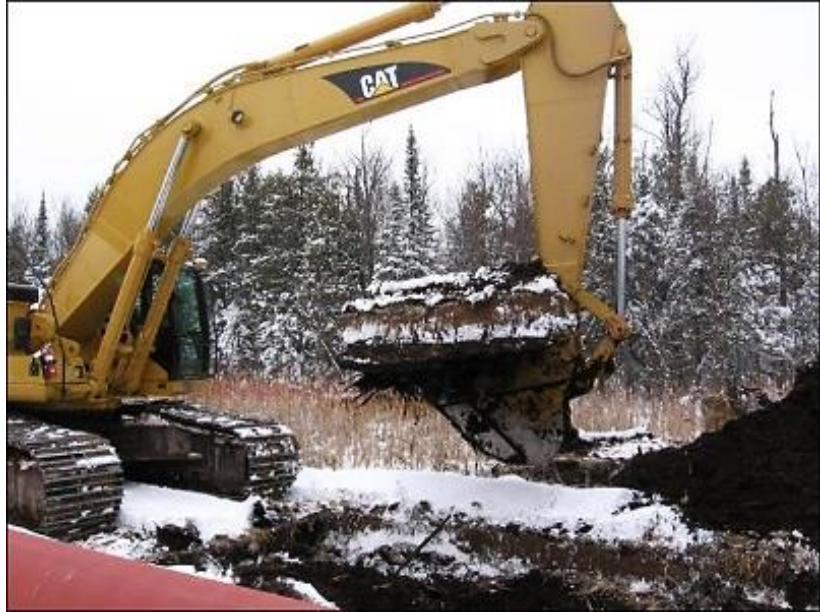
Segregating Frozen Topsoil Layer in Wetland

Construction through wetlands and other wet areas presents its own unique challenges, such as wheel rutting and mixing of soils, impacts to plants and other species, and downtime from construction equipment becoming stuck in loose or saturated soils. The following elements contribute to the challenges inherent in crossing and restoring wetlands and waterbodies and are addressed in this section: soil types, extent of freezing, topsoil segregation requirements, open ditch limitations, and trench subsidence and crowning.