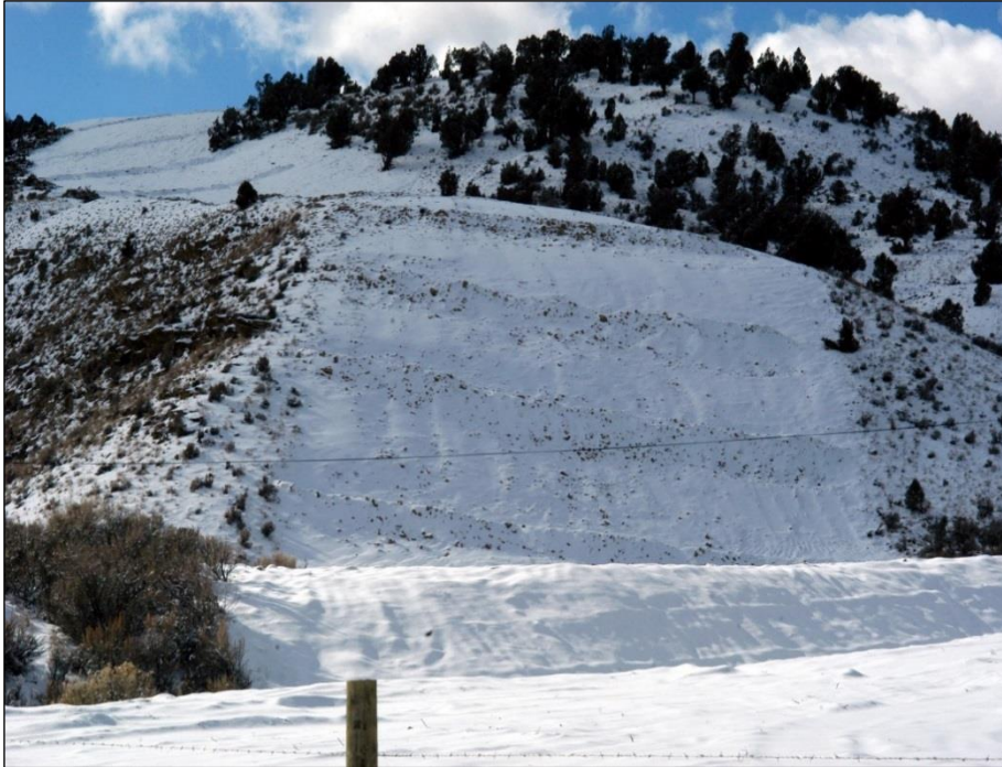
Right-of-Way Stabilized for Winter

Whether restoration is completed under frozen conditions or delayed until the spring or summer period, the right-of-way will require stabilization prior to the spring thaw. Seed intended for site stabilization or restoration will not germinate under frozen conditions, and therefore Companies should plan for alternative methods of site stabilization prior to the first spring rains (see Section 7.0, Temporary Erosion and Sediment