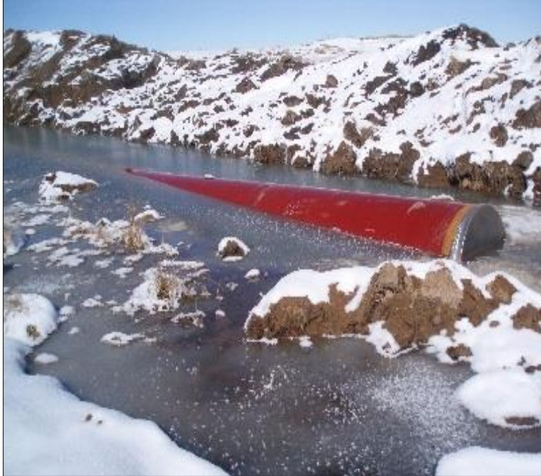
Trench With Frozen Infiltrated Groundwater

Equipment Care: Freezing conditions make operating equipment outdoors more difficult. Lubricants and other liquids in pumps can freeze up and not operate. Plans should consider measures to ensure equipment is protected from the elements and operational prior to use. When dewatering during freezing conditions, pumps may have to be installed in small, heated shelters to prevent the pumps from freezing and becoming non-operational or causing damage to the pumps that could result in a spill or leak of lubricants or fuel. The use of anti-freeze liquids in the pump housing is not recommended due to the difficulty of removing the potentially hazardous liquids prior to the re-use of the pumps.