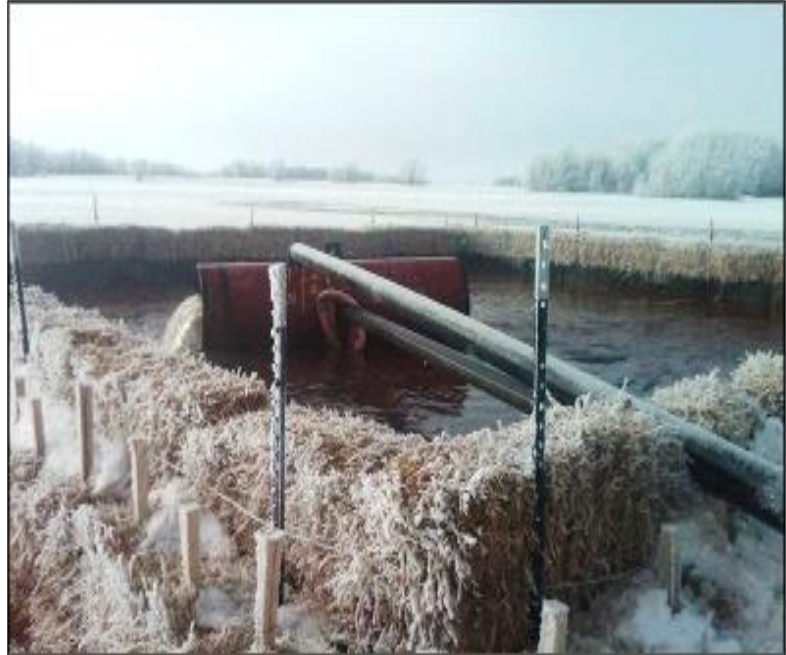
Hydrostatic Test Water Discharge Structure

The management of water is an essential factor of pipeline construction. All new pipelines require the use of water to perform hydrostatic testing prior to placing the line into service. In addition, depending on such project-specific factors as geography, climate, and season, open trenches may fill with water from rain events or from the presence of groundwater. Water in the trench must often be removed (trench dewatering) to prevent the trench sidewalls from collapsing or otherwise to maintain trench or backfill integrity prior to or during pipe installation and restoration. All of these activities can become difficult at best, and dangerous at worst, during sustained frozen conditions.