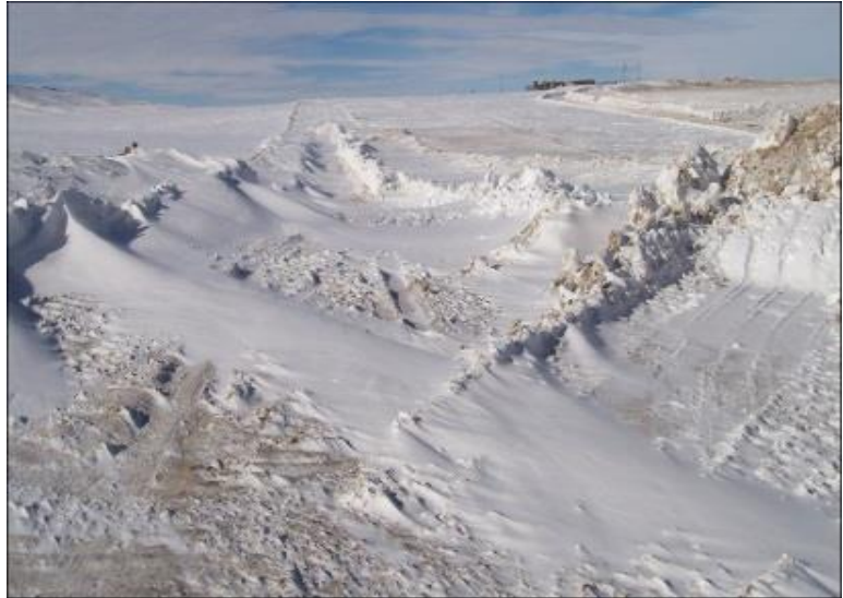
Snow Covered Right-of-Way

Significant snow fall events before or during construction can create unsafe work conditions and make it difficult to complete the job properly. Removal of snow from the construction workspace may be necessary to provide safe and efficient working conditions and to expose soils for grading and excavation. Snow may also need to be removed along access roads to allow safe access to the right-of-way.