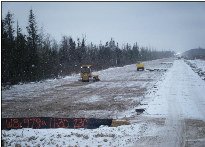
Preparing the Right-of-Way