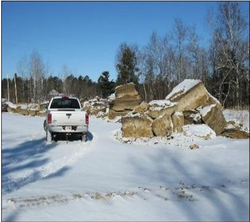
Topsoil Frozen to Subsoil

Frozen soil conditions in upland (unsaturated, non-wetland) areas can create a firm working surface with a low potential for topsoil mixing. Planning to construct over frozen soils could be a factor in determining how large of an area over which to segregate topsoil. However, frozen conditions are not always consistent and intermittent thaws can occur depending on the location or annual variations in cool season temperatures. Construction or restoration work could extend into the spring thaw period due to unanticipated schedule slowdowns or an unseasonably early thaw period.