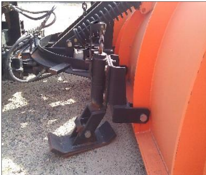
Equipment Modified With a Shoe

Snow removal activities should be monitored by the Environmental Inspector.