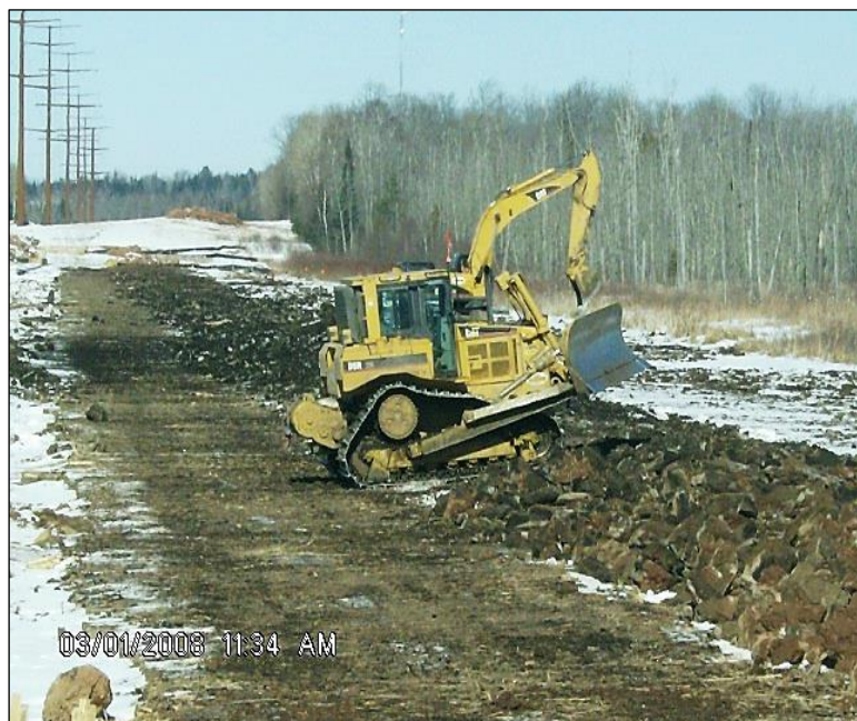
Reducing Frozen Crown Over Backfilled Trench

The crown should only be constructed directly over the backfilled trench with native material and should not extend out beyond the trenchline. Subsoil used to build the crown should not extend above natural surface grade. A crown should always be capped with native topsoil material to ensure elevations will be restored with topsoil at the surface. If the topsoil layer has been removed