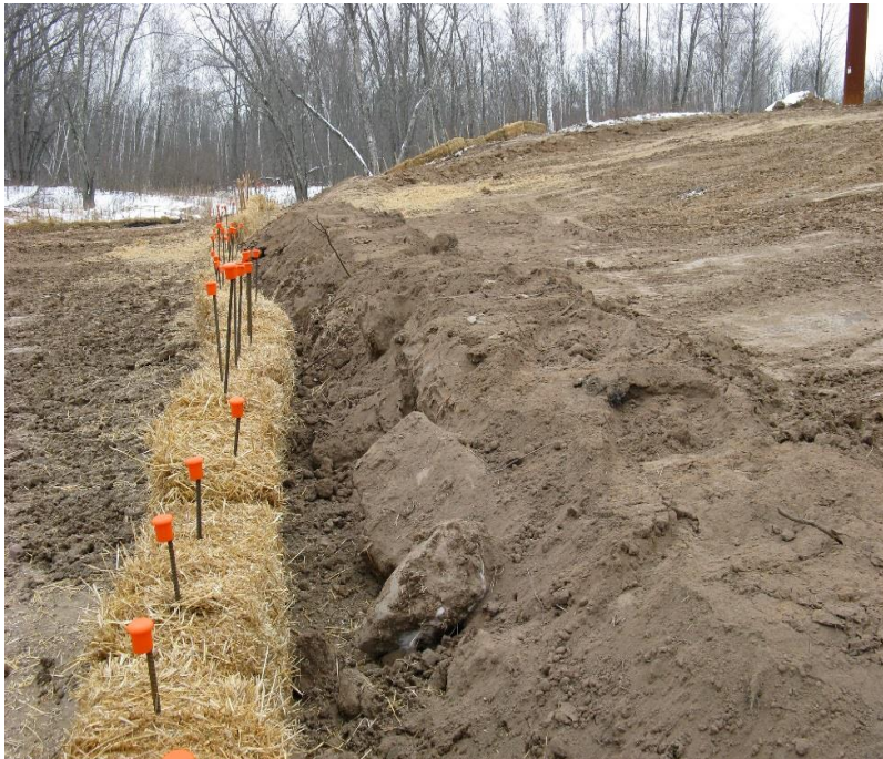
Erosion Control Devices With Protective Caps on Metal Stakes

Certain areas of the right-of-way may not be accessible during thawing periods or during the spring melt due to soft soil conditions, thus preventing regular inspections and hampering repairs or maintenance.