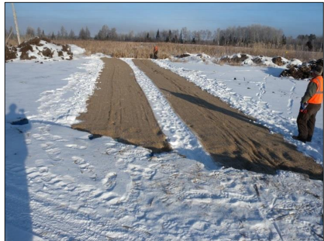
Stabilization of the Right-of-Way

Timing of Restoration: Determine whether the project will be completely restored or if restoration will be delayed until after the spring thaw. Backfill all areas of open excavation or provide safety fencing and signage for protection. If restoration will be delayed, consider leaving the subsoil in a roughened condition to slow the sheet flow of water. After restoration, restore contours for drainage to preconstruction conditions. Delaying seeding can also result in the development of noxious weeds that require treatment, such as the application of herbicides, prior to additional seeding and other restoration activities.