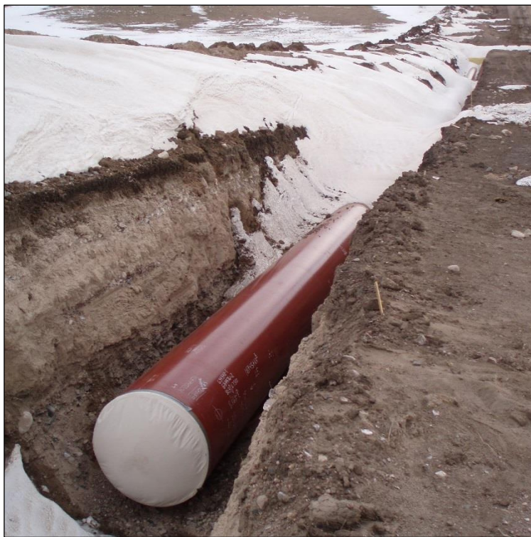
Pipeline Construction in Frozen Conditions

indicated for a given project. The FERC's recommendations recognize the increasing incidence of natural gas pipeline construction during winter months and under frozen conditions, especially in the northern, northeastern, and Rocky Mountain regions.