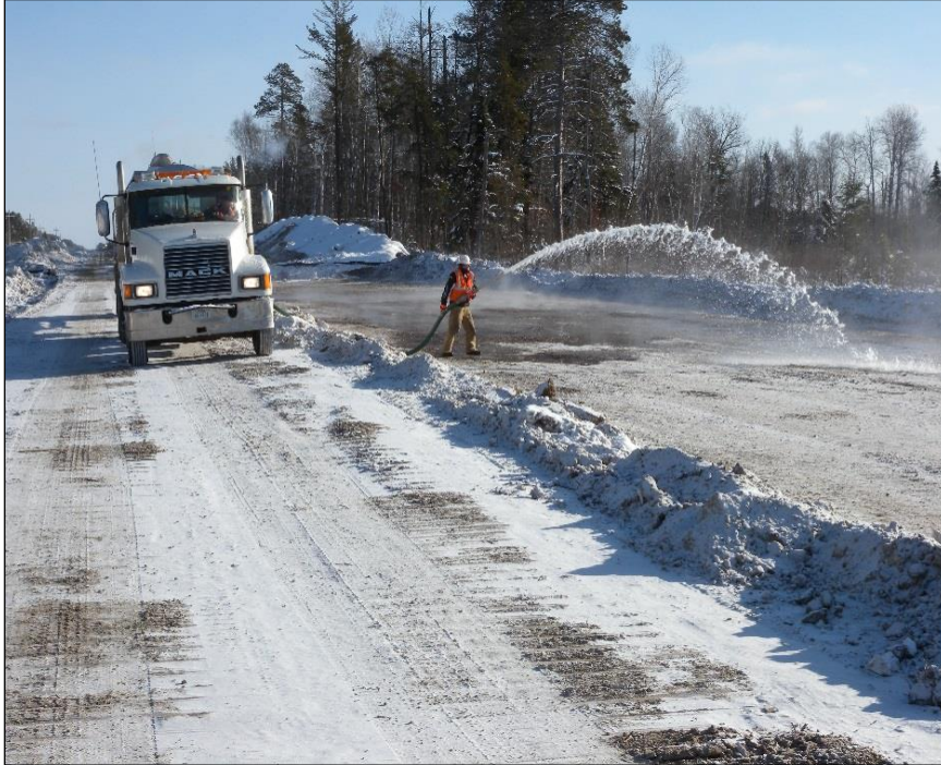
Building the Ice Road

Once the frost road is established, it should be maintained by removing or compacting additional snowfalls to prevent development of an insulating cover as well as to maintain equipment travel. A layer of snow should be kept on the frost road to reflect the sun's energy and minimize thawing during warmer periods of the day. Darker areas of exposed soil can absorb heat and accelerate thawing, reducing the length of time the frost road can be safely used. Bare spots should be covered with snow as soon as possible.