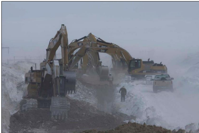
Pipeline Construction in Frozen Conditions

In a March 2013 report on United States natural gas pipeline capacity, the U.S. Energy Information Administration (EIA) noted that “more than half of new pipeline projects that entered commercial service in 2012 were in the Northeast.” 1 Elsewhere on the EIA’s website, data show that the number of producing gas wells in the United States has increased by 36 percent from 2001 to 2011. 2 This number includes an increase in producing gas wells of 36 percent in Pennsylvania and Colorado and 152 percent in North Dakota over the same