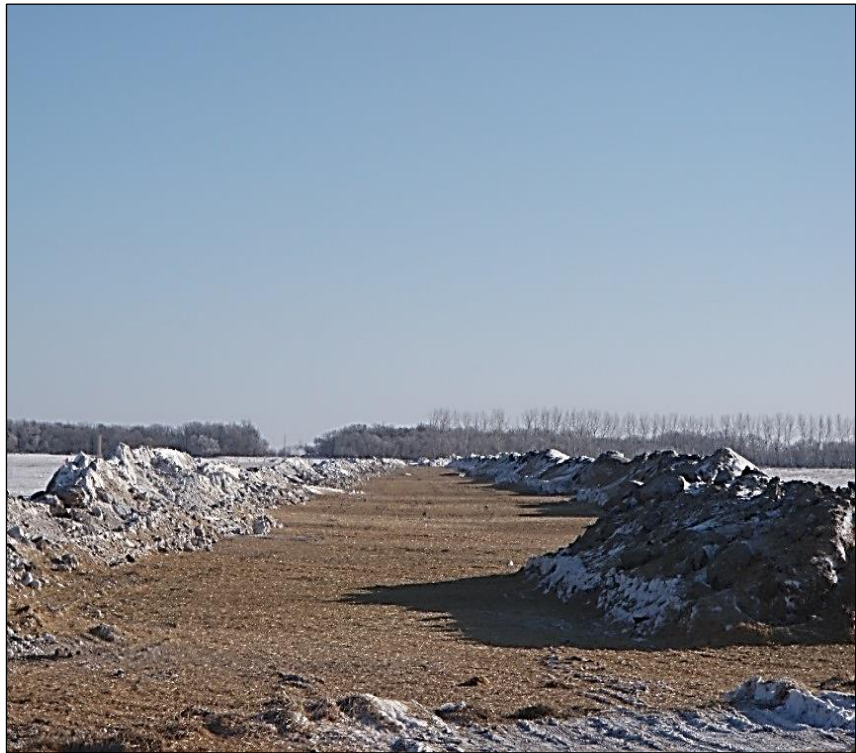
Right-of-Way Prepared for Final Stabilization

Monitoring Plan: If final cleanup and restoration activities have not occurred prior to the spring melt, monitoring of the right-of-way should be implemented during the delay between construction and restoration or temporary shutdown of construction activities. The monitoring program should identify: (1) erosion control structures requiring repair; (2) areas of slope instability; and (3) areas where significant levels of erosion are occurring. The EI should determine the most effective means of dealing with identified problems, taking into consideration the suitability of the right-of-way for access by equipment, potential damage that could