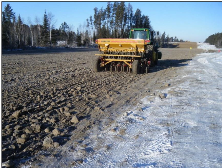
Drill Seeder in Upland Area

Landowners: The plan should emphasize the importance of communicating with landowners throughout frozen conditions about construction activities, construction shut downs, restoration of the right-of-way and cleanup activities timing. It is important to address their expectations for the overall timeframe for construction and restoration activities and for access across the right-of-way at all phases of construction considering that winter construction often extends the overall period of disturbance.