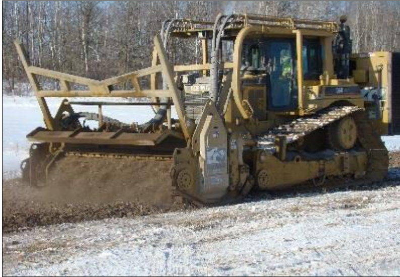
Iron Wolf Breaking up Frozen Topsoil

Topsoil Removal: Topsoil segregation should be completed prior to frozen soil conditions where practicable in areas with long periods of frozen conditions. When the topsoil is frozen at the time of topsoil stripping, multiple passes (vs. a single pass) with a bulldozer or other specialized equipment may be necessary to remove only the topsoil and not the subsoil. Specialized equipment (e.g., soil rippers) may be necessary to break up the topsoil prior to removal. An “Iron Wolf” or pavement grinder can remove frozen topsoil; however, the use of this method should be reserved for special situations and in cooperation with landowners and regulatory agencies because this process can affect the native soil structure.