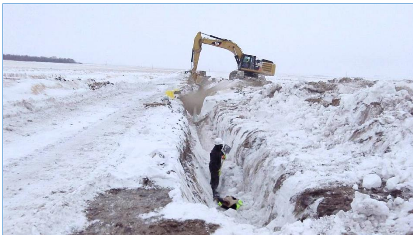
Snow Removal From Trench

The guidelines presented herein focus on construction and environmental protection practices unique to frozen conditions. These guidelines primarily focus on providing additional information to Companies regarding what to consider when developing a project-specific frozen conditions plan and what past practices have been successful under frozen conditions. In this way, the guidance presented in this document may also be used by Companies to develop project-specific plans based on each project's unique location, timing, and other variables.